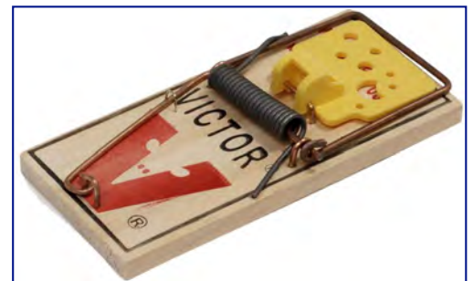
Snap trap.

Electronic traps kill rats by electrocuting them with high-power batteries. They catch one rat at a time and are expensive compared to snap traps. The traps are convenient in some situations, especially with individuals who are squeamish about cleaning snap traps for reuse. The electrocuted rat slides out of the trap with minimal handling when the trap is emptied.