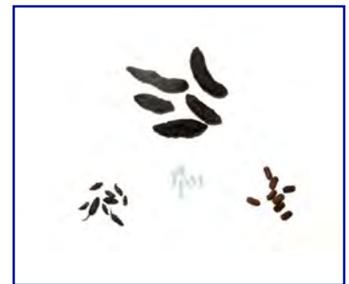
Clockwise from the top are Norway rat, American cockroach, and mouse droppings.