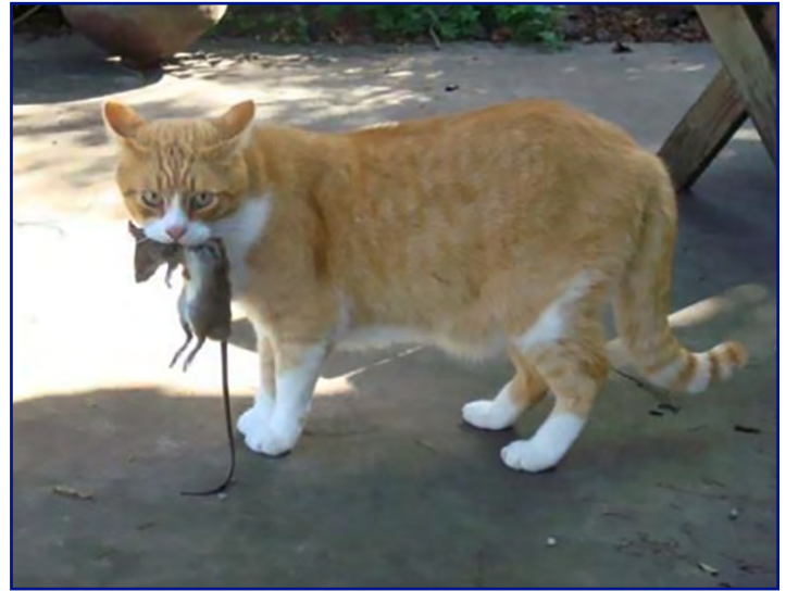
Domestic cats can help keep rat, mice, and vole populations down. Be aware that cats, especially feral cats, may prey on non-target organisms (birds, lizards), including endangered species.